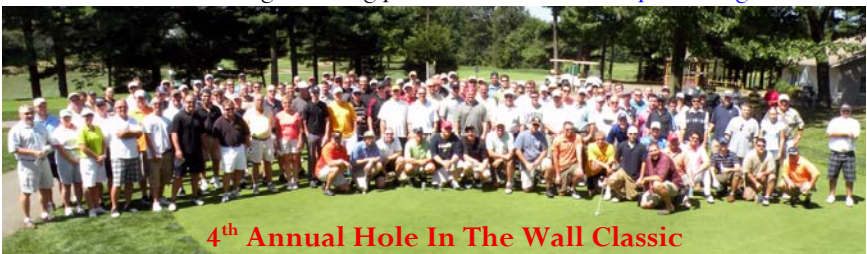
4 th Annual Hole In The Wall Classic