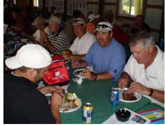
Tournament Banquet Dinner

The 4th Annual Hole In The Wall Classic Charity Golf Scramble held on Saturday, August 30th was an overwhelming success. On a beautiful, sunny day 145 golfers and more than 20 volunteers came together at Sable Creek Golf Course, in Hartville, Ohio to raise funds for Flying Horse Farms, the newest, future Hole In the Wall Camp (HITWC) located in Mt. Gilead, Ohio. Outing participants had a great day of sun and fun, which included lunch, golf and a steak dinner afterwards. In addition, each golfer received a “goodie bag” full of snacks, golf items, valuable gift certificates and discount coupons all donated by our sponsors. The day ended with a Silent Auction, where golfers enjoyed bidding on items donated by many local retailers and golf courses.