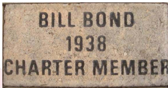
Above. Sample of a memorial brick in the patio. Left. Picture from the 2007 patio dedication BBQ Cook-out Party hosted by the Graduate Council. The brick patio holds the many attending actives, alumni and families. Limestone blocks shown in front of stone grill/fireplace.